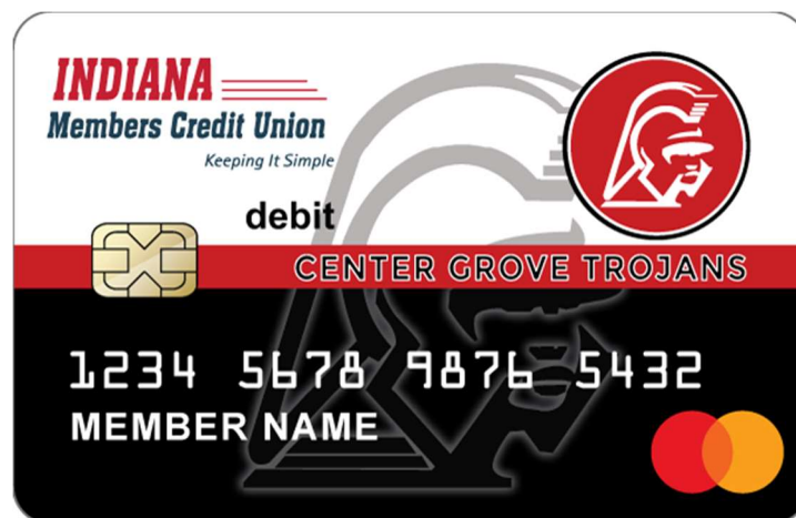
*Pictured is the Indiana Members Credit Union, Center Grove Trojans debit card.