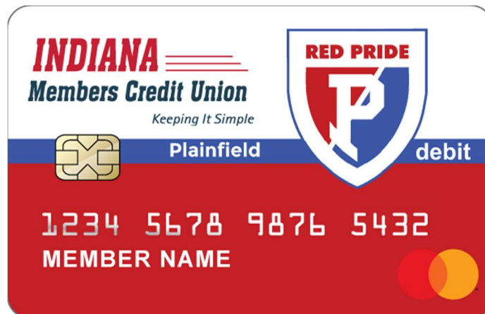
*Pictured is the Indiana Members Credit Union, Red Pride Booster Club debit card.