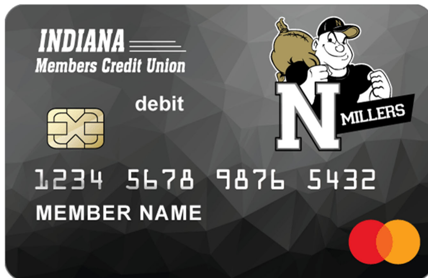
*Pictured is the Indiana Members Credit Union, Noblesville Millers debit card.